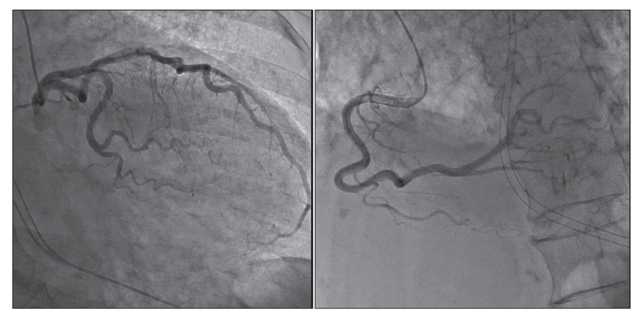
Fig. 3. Coronary angiography. There is no noticeable stenosis or obstructive lesion in the left main trunk, left anterior descending coronary artery, and left circumflex coronary artery, and right coronary artery.

and the condition was restored; however, a large amount of fresh blood was detected in the intubation tube, indicating alveolar hemorrhage. Coronary angiography was performed to determine the cause of cardiac arrest, and no noticeable stenotic or obstructive lesions were found in the coronary arteries (Fig. 3). The patient was treated with intensive care and strong immunosuppressive therapy (1,000 mg of methylprednisolone administered intravenously for 3 consecutive days and one plasma exchange therapy). T wave inversion was gradually improved, and the cardiac function evaluated by echocardiography was improved in 2 weeks. At the time of admission, left ventricular ejection fraction (LVEF) was evaluated as 67%, but at the onset of takotsubo syndrome, the LVEF was 20%-25%. Then, 2 weeks from the onset of takotsubo syndrome, LVEF was improved to 63%. Although the patient initiated maintenance hemodialysis, the activity of AAV was well controlled. Accordingly, the patient was transferred to another hospital for rehabilitation.